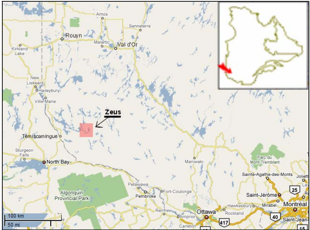
Figure 1: Location of the Zeus property Modified from Google Maps (2008)